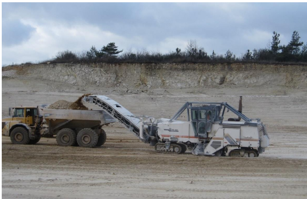
Fig. 1. Operation of the Wirtgen 2200 SM combine with direct loading onto technological trucks on the "Raciszyn" limestone deposit.