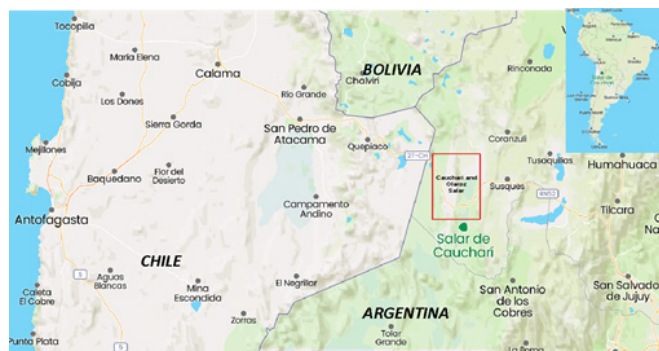
Fig. 1. Location of the mine