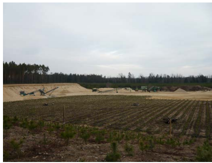
Fig. 1. View of the sand quarry technology in Novosedly nad Nežárkou. An already reclaimed land can be seen in the forefront Rys.1. Widok całkowicie zrehabilitowanego terenu kopalni piasku Novosedly nad Nežárkou