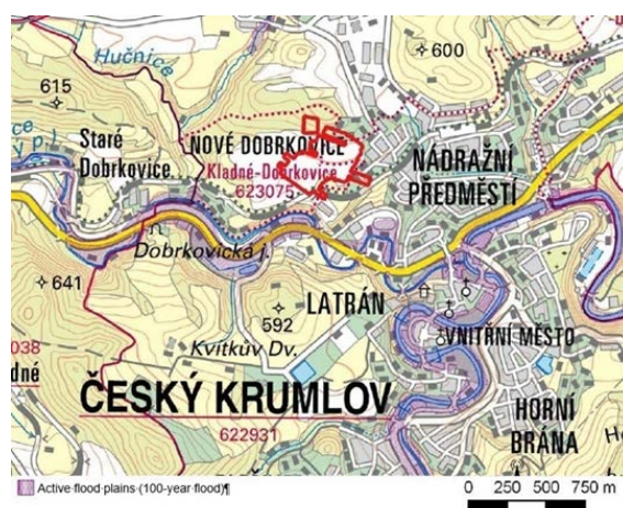
Fig. 4. Locality Český Krumlov – Městský Vrch – flood plains Q100 [16], the border of the graphite deposit is marked in red Rys. 4. Miejscość Český Krumlov – Městský Vrch – zalew Q100 [16], granica złóż grafitu zaznaczona jest na czerwono

ing and permitting constructions, may occur only when significant landscape elements are preserved, especially reserves, cultural landmarks in the landscape, harmonic aspect and relations in the landscape. Preserving the relations in the landscape shows as the most important within the landscape character assessment. These are mainly represented by the passability of the landscape for various organisms.