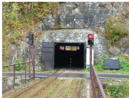
Fig. 2. A view of the entry into the graphite mine in Český Krumlov Rys. 2. Wejście do kopalni grafitu Český Krumlov

It must be pointed out that it is a legitimate process that is open to public and other concerned parties, and thus there are extreme demands on communication. In addition, it is a process of a preventive character, which is, based on expert report, supposed to clarify the questions of compatibility of the planned project with the requirements for the protection of the environment and of its constituents, requirements for public health protection and the requirements for rational land use.