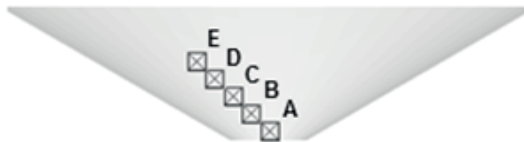
Fig. 2. Marking of the average velocity measurement zones during the simulation and high-speed PIV recording Rys. 2. Oznaczenie strefy pomiaru średniej prędkości w czasie symulacji i nagrywania szybko kamerą PIV