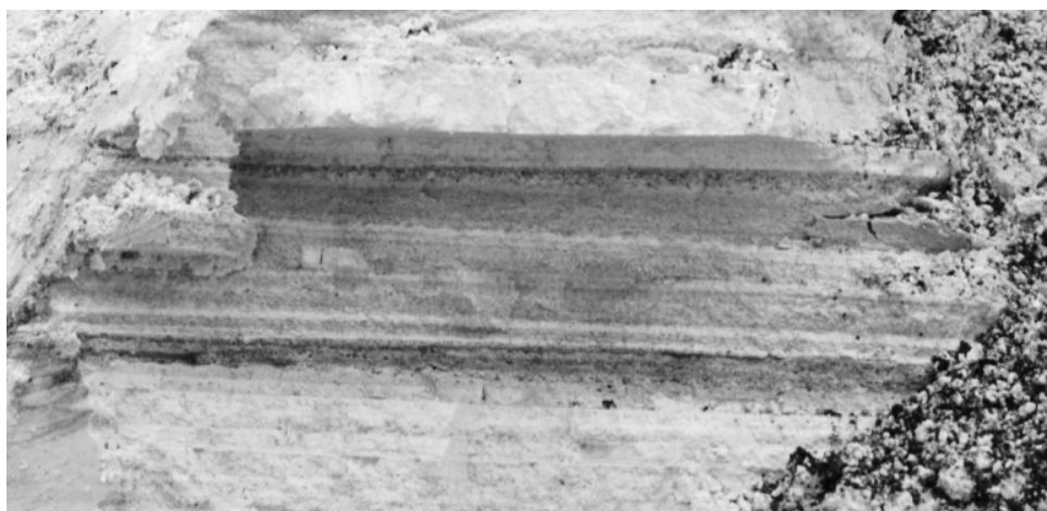
Fig. 2. Sediment layer system in the pond No. 3. The area former landfills KZS "SOLVAY" in Krakow

Ryc. 2. Struktura warstwowa osadów zdeponowanych na stawie osadowym nr 3, na terenie byłych składowisk KZS „SOLVAY” w Krakowie