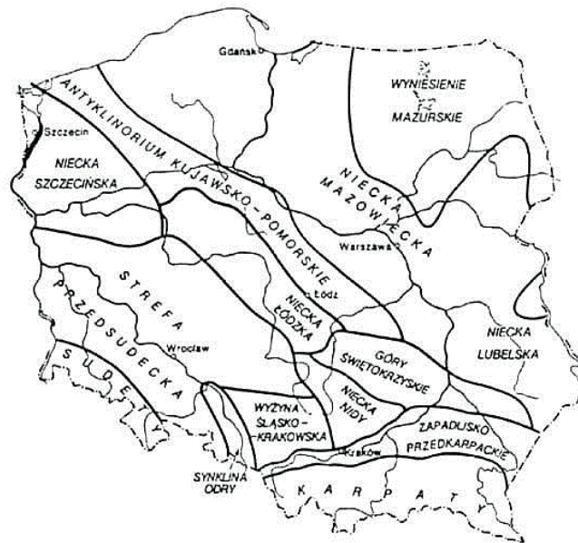
Fig. 1. Geological division of Poland [6]

Tables 2 and 3 present chemical composition and sensory properties of geothermal water from the borehole Uniejów PIG/AGH-2. Changes in chemical composition of thermal waters in subsequent boreholes depend on the depth. The difference in the depth of the roof of the water bearing horizon (60 m) and distance of 1950 meters between the boreholes of Uniejów PIG/AGH-2 and Uniejów IGH-1 and is not complementary to the difference in mineralization of about 23%. As-