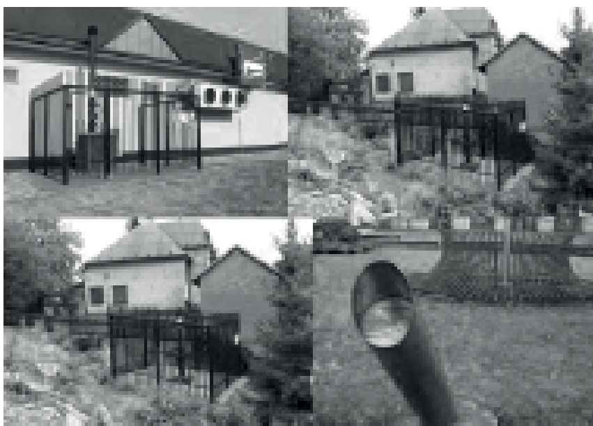
Fig. 3. Protection by means of gas drainage borehole

Rys. 3. Ochrona metodą drenażu gazu z pokładów przez otwory wiertnicze