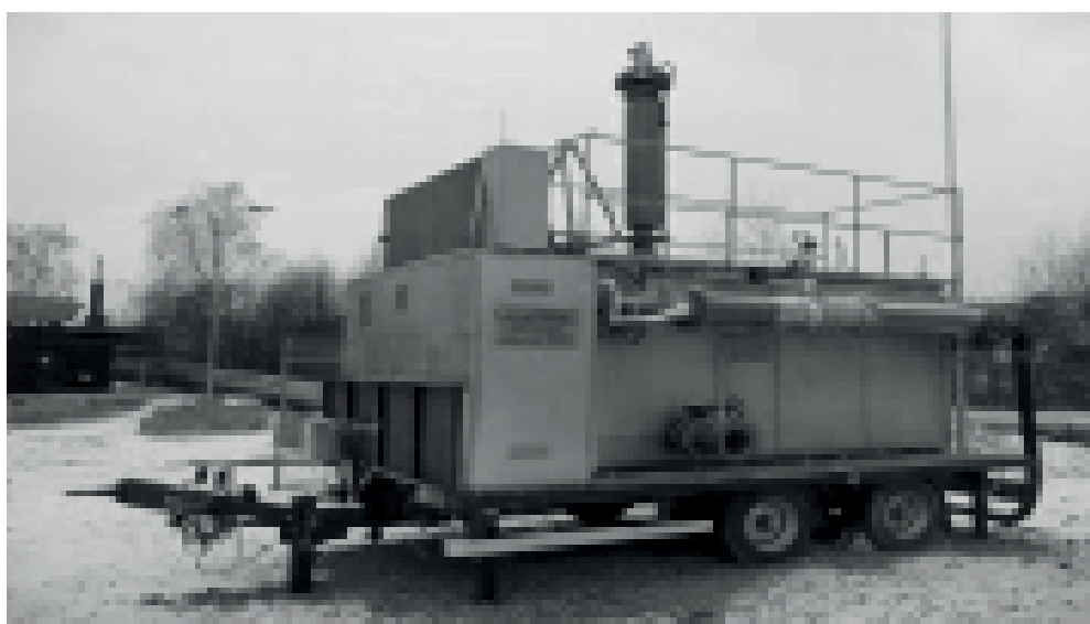
Fig. 2. Mobile exhaust station

By the year 1998, building permits were issued for the area of Ostrava-Karviná Coalfield regard-