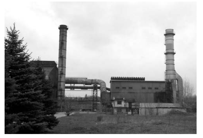
Fig. 2. View on the plant after implementation of resource-conserving technologies